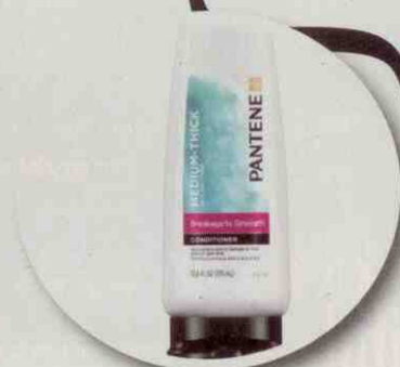
Photo by Monkey Business Images/Dreamstime.com; Middle: Photo by Chiya Li/Stock.com; Bottom: Photo by Olga Ryabova/Stock.com; Background Photo by Theresa Tibbitts/Stock.com

Shopping for hair products just got a bit easier! According to Ron, women no longer have to rely only on products that have a Black girl's face on it like they did in the '80s. "Many mainstream product lines like Pantene and Ouidad now cater to different hair types and problems that pertain to African Americans." And interestingly enough, some of those product lines made specifically for women of color, such as Mizani, are owned or created by Whites and Asians.